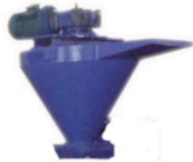
Optional Hopper Screw Feeder